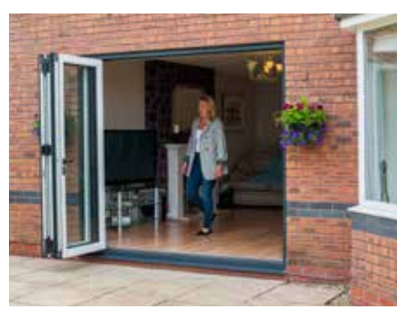
The Imagine Bi–Fold Door makes an attractive alternative to a traditional sliding patio door; completely opening your home up to the garden or patio.