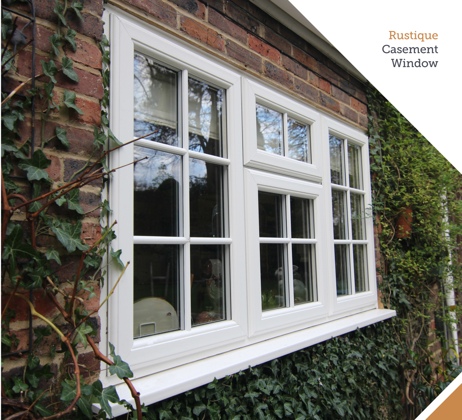
Rustique Casement Window