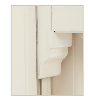
Sash Horns in 3 styles