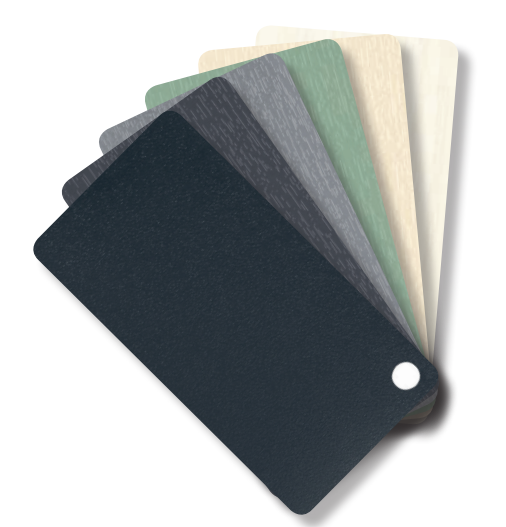
GET IN TOUCH Contact your installer to request a swatch book including the full range of colour and woodgrain options.

Fancy something a little bit different? From Chartwell Green to Irish Oak and everything in-between choose from a huge range of colours, allowing you to express your personality and style.