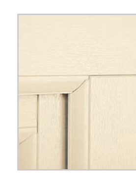
Colour and Texture