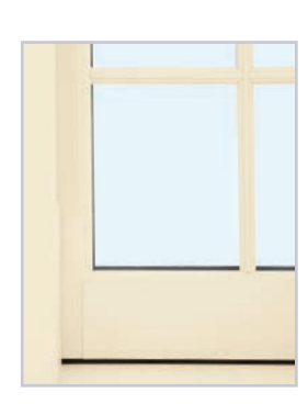
Deep Base Rail